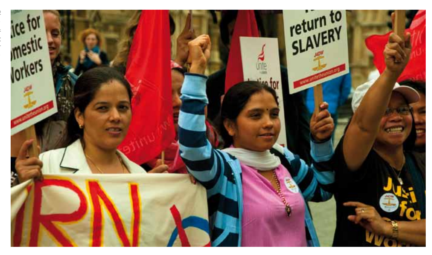
On 4 September, migrant domestic workers rallied outside the Houses of Parliament in London